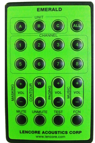
G661 - n.FORM™