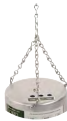
INV - Inverted