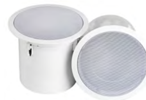
LG035 - Ceiling Plate