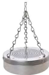
TRI - Tripod