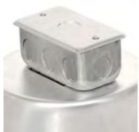
HB - Handy Box (St. Louis, Miami, etc.)