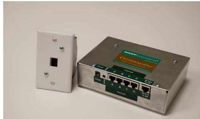
INFRA-RED WALL CONTROLLER AND INFRA RED-HUB