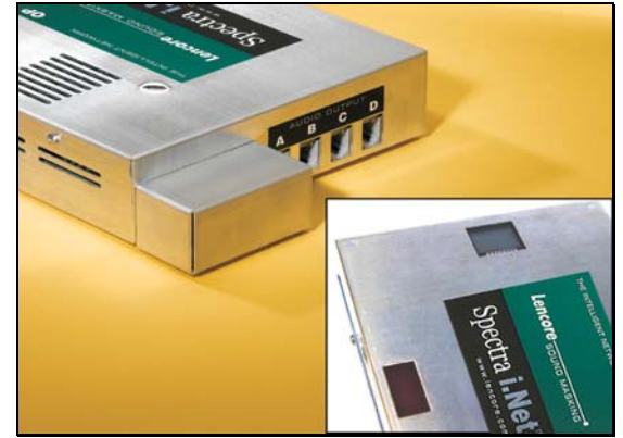
OP is UL Listed and approved for use in air-handling spaces.

The Spectra i.Net™ system is the most sophisticated masking system available when a network system is required. The system features fast, complete control over every sound frequency for masking. Extreme design flexibility, plus, easy system expansion with the addition of sound sources and speakers to the network. Sound control with the click of the remote or mouse, even off-site. Preferred, award-winning sound quality, only from Lencore's Systems.