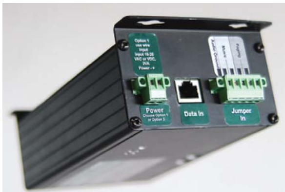
Lencore CrosswaysOne™ Router

Page and music may also be routed out of the router via internal jumpers to the screw terminals located on either end of the router to integrated Platform amps or component amplifiers and equalizers for signal boost and correction. This setup is typically run at approximately the 60th Platform in a run.