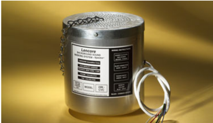
Unit shown 6" dia. x 6" h.