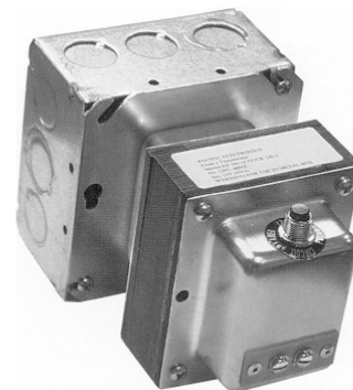
Model 95T-16 Shown attached to standard junction box.